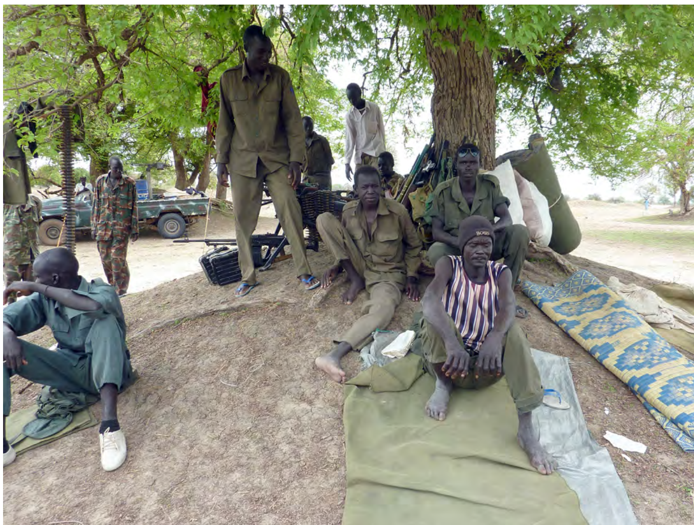
SSM/A fighters awaiting integration in Mayom, Unity, 9 May 2013.

In response, throughout 2012, the SPLA strengthened its military presence along its border with Sudan. Their responsiveness to attacks from the Southern insurgents in Sudan increased, and according to the SPLA commanders in Upper Nile and Unity, they were