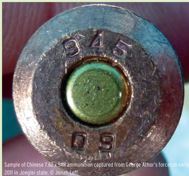
Sample of Chinese 7.62 x 54R ammunition captured from George Athor's forces in early 2011 in Jonglei state.

year, SSDF forces under the leadership of John Duit handed over identical rounds after crossing into South Sudan from Blue Nile. The Small Arms Survey has observed similar varieties of 7.62 x 39 mm ammunition with different batch numbers and production years with other Southern militias as well as among weapons that the SPLM-North (SPLM-N) captured from SAF in South Kordofan and Blue Nile.