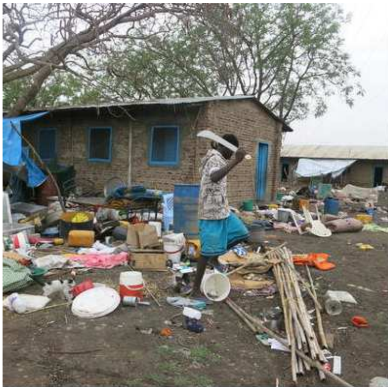
Compound of Christ The King Church in Malakal