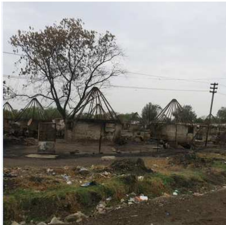
Burned down homes in Malakal

When Amnesty International visited the town from 10 to 14 March, it was under the control of opposition forces. Much of the town lay in ruins, with homes and other property looted and burned down. The entire civilian population had fled, with only a few individuals connected to opposition fighters remaining in town. Some 21,000 people, mostly Shilluk and Dinka and a smaller number of Nuer, were sheltering in the protection site of the UNMISS base at the edge of town. The rest had fled to surrounding rural areas and farther afield. Large numbers of Nuer had reportedly gone to the opposition stronghold of Nasir to the south-east.