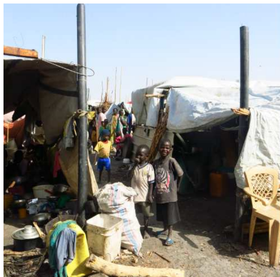
Malakal IDP camp where thousands live in dire conditions, March 2014.

UNMISS peacekeepers are currently conducting patrols around the immediate vicinity of the protection sites. They should increase patrols and extend them farther to both to better ensure the safety of those within the protection sites and as well as to improve security for those who wish to venture outside, or leave. The Mission should provide escorts to those who need to move beyond the perimeter of the protection site for essential purposes. According to UNMISS, the delays in the arrival of troops have so far constrained the Mission's ability to extend patrols. 79