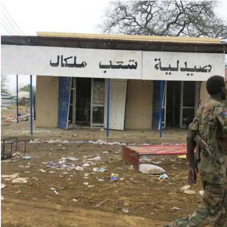
Armed opposition fighters outside Malakal Hospital