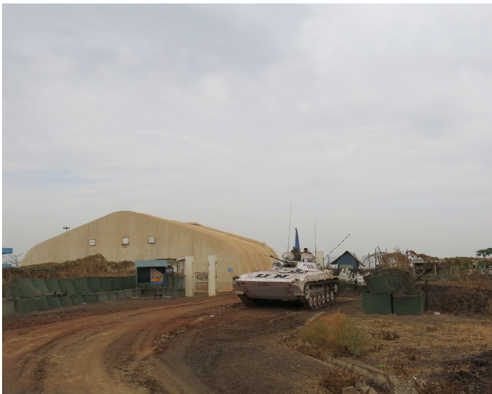
UNMISS armoured vehicle at the base where residents displaced by the conflict are sheltering in Malakal

UNMISS is providing sanctuary for some 80,000, of the 950,000 who are currently internally displaced by the conflict. 74 They are sheltering in the protection sites of eight UNMISS compounds across the country, and many of them are too afraid to venture beyond the gates. In offering sanctuary and providing protection for these individuals, the Mission has undoubtedly saved many lives. Yet it has found itself in an unprecedented situation and in a role for which it was not prepared. The Mission had envisaged perhaps being called upon to provide a temporary safe-haven during intense conflict, after which civilians would return to their homes. But now, several months into the conflict, civilians have not left and more continue to seek refuge in UNMISS protection sites that are not designed to host such large numbers of people over long periods of time. There are, in addition, serious security concerns. Civilians and armed actors seem oblivious to the protections accorded under international humanitarian law to places of sanctuary, to UN peacekeepers, and to peacekeeping bases.