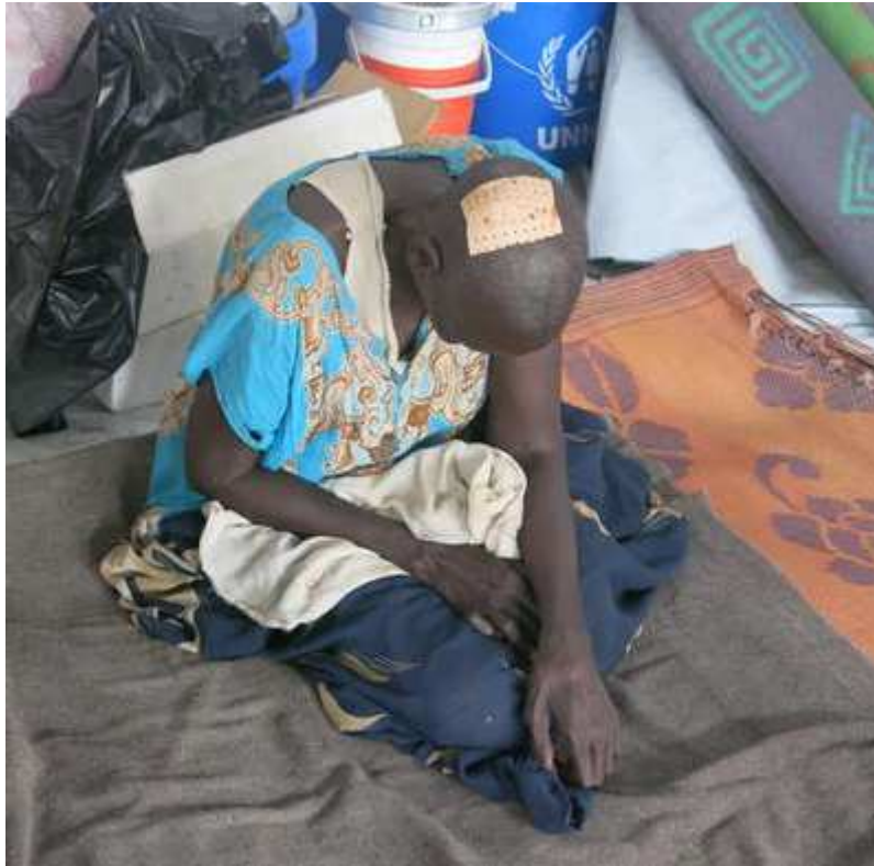
This blind elderly Shilluk woman was beaten by opposition fighters in Malakal hospital in February 2014.