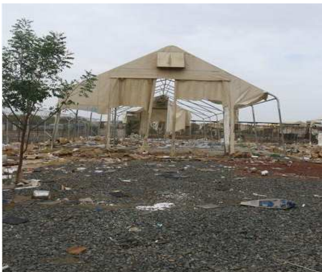
WFP food store in Malakal looted and trashed; the looting and destruction has worsened an already severe food crisis.

World Food Programme (WFP) warehouses in Malakal were completely looted and destroyed in January, when opposition forces gained control of the town. Civilians participated in the looting, accelerating the speed and scale at which properties were taken. Food supplies sufficient to feed 400,000 people for three months were reportedly looted in less than three days. In the surrounding areas, Amnesty International delegates saw scattered empty tins of oil—all that remained.