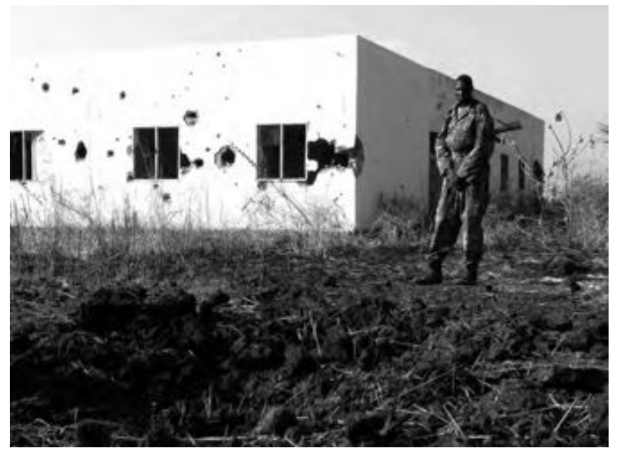
Image 5: Effects of the aerial bombardment conducted over Chali al Fil on 29 November 2012 on the local health care centre, built in 2008. Bombs also fell in the immediate vicinity of the mosque, setting fire to the building.

During the first phase of the war in particular, a number of high-ranking SAF officers publicly declared that SAF and PDF troops had succeeded in capturing military equipment from SPLM-N units, either during military confrontations or simply by collecting stockpiles the rebels could not transfer before