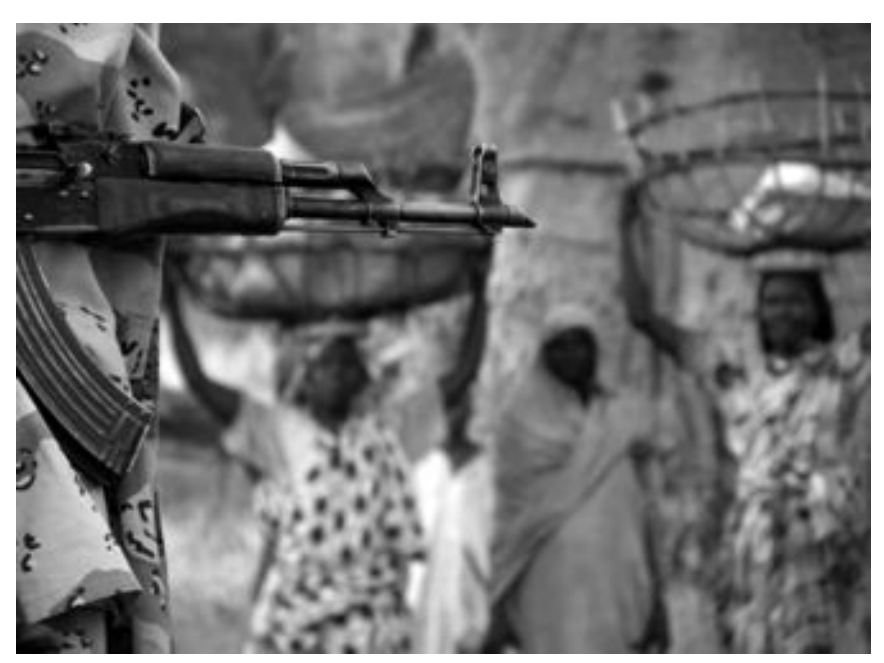
Image 9: Women wait for food assistance during the distribution programme undertaken by FYDA in Wadaka, late November 2012.

In November 2012, the local Funj Youth Development Association (FYDA) conducted the first food distribution programme in selected areas of southern Blue Nile, including Tenfona, Wadaka, and Yabus. 143 The author observed several phases of the programme in Wadaka, where only sorghum was distributed, after having been bought at a South Sudanese market and transported from Upper Nile by road (see Image 9). Overall, 1,060 75-kg bags were distributed among the displaced communities, only partially responding to the needs.<sup>144</sup> FYDA staff in charge of the distribution programme could not provide the exact number of beneficiary households, nor the overall figure of the displaced households in the area targeted by the distribution programme, as registration and