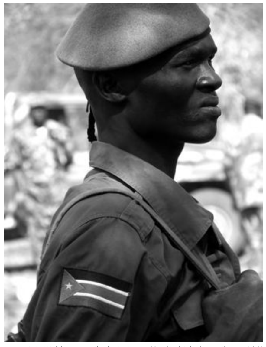
Image 10: An SPLM-N fighter wears a uniform bearing the national flag of South Sudan during a military parade held in the 2^{nd} Division general headquarters, late November 2012.

about the provision of medical assistance to 175 wounded troops who were transported and treated in medical facilities in Bentiu, Juba, and Wau (Sudan Tribune , 2013k).