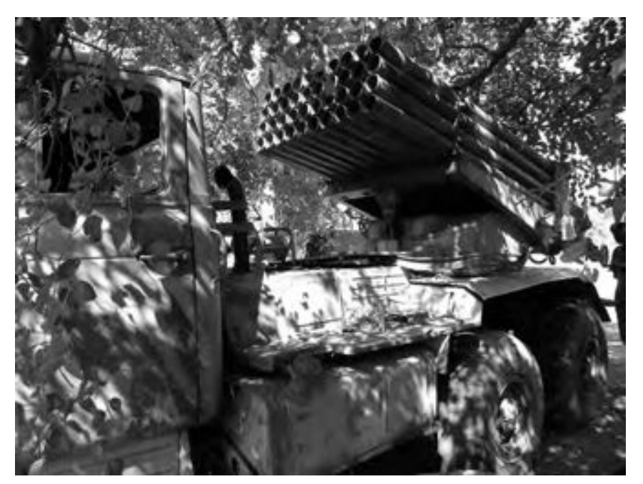
Image 8: This BM-21 multiple-launch rocket system was reportedly captured from SAF in July 2012.