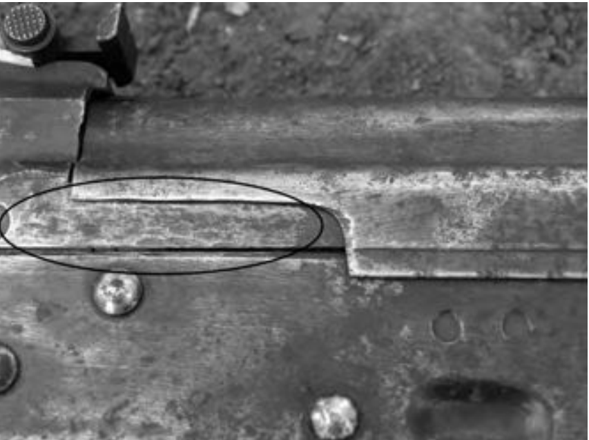
Image 2: Assault rifles reportedly captured by the SPLM-N after the attack launched by Kamal Loma's militia on Rum in April 2012. In the course of the offensive, SPLM-N forces allegedly captured 96 weapons identical to the one shown in this picture.

Image 3: The weapon's serial number has been removed.