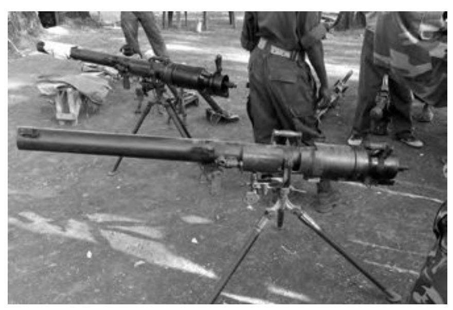
Image 7: 82 mm B-10 recoilless guns (type 65) under SPLM-N 2nd Division custody, reportedly captured on 1 September 2011 in Ulu.