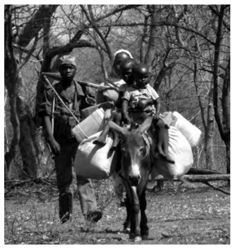
Image 1: Civilians and SPLM-N fighters reach Kubra after the rescue operation conducted in the Ingessana Hills, 4 December 2012.

the community that settled in Jebel el Tin, a registration exercise undertaken on the night before the convoy arrived in Kubra was interrupted after more than 600 individuals had been listed.42