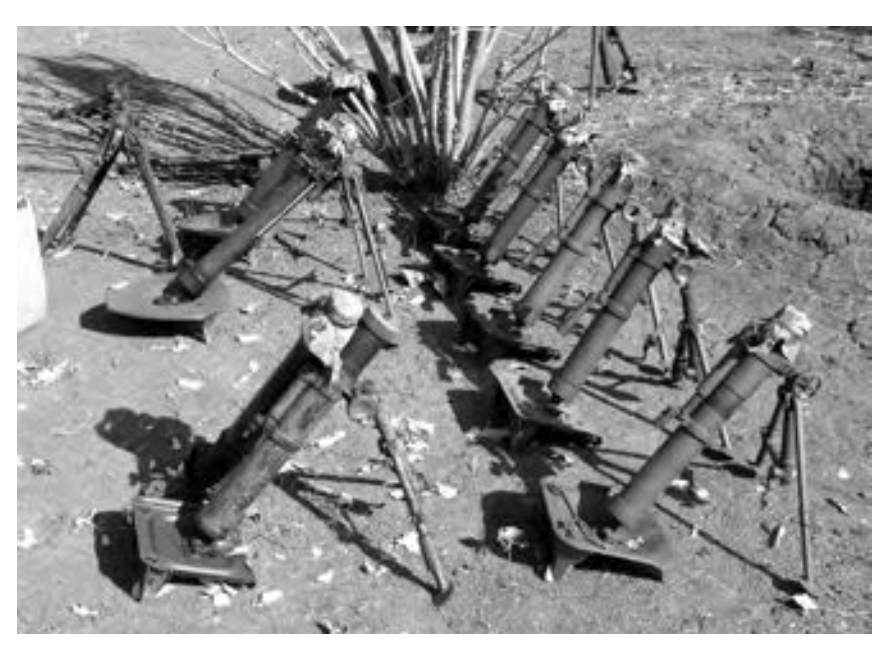
Image 6: 60 mm mortar tubes displayed for a weapons inspection by the SPLM-N 2nd Division on 30 November 2011. All mortars were reportedly captured in Ulu in early September 2011.