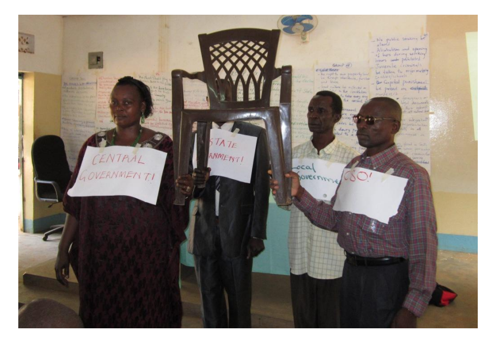
Participants in Yambio - Chair exercise to explain the balance of powers between the arms of government