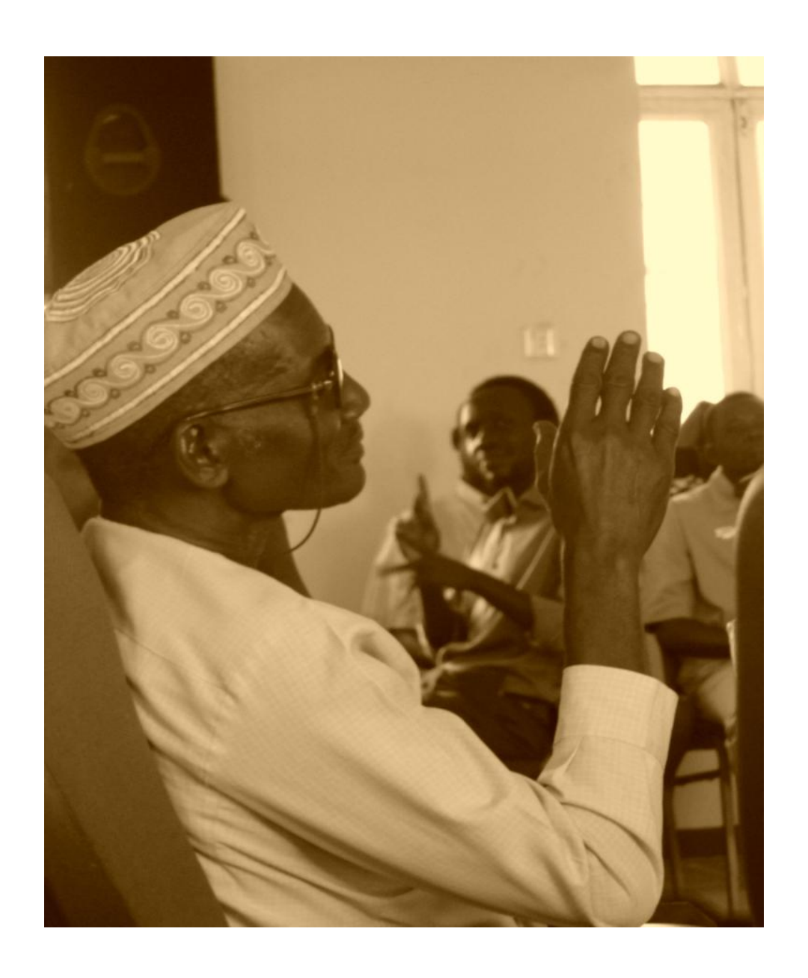
Dialogues implemented from April 2012 – July 2013 across the ten state Analysis of data July 2013 – July 2014