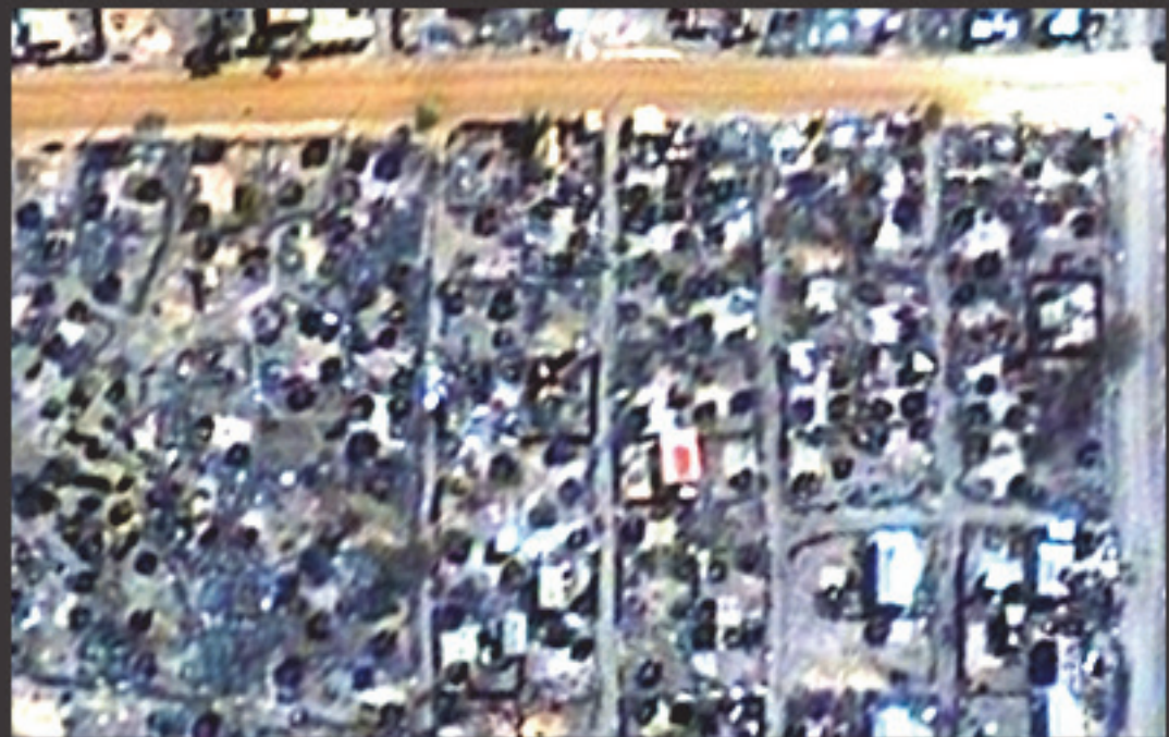
Images of a neighborhood close to the center of Malakal town taken on February 17 and again on February 23, showing burning of buildings. Opposition forces held the town between February 18 and March 19, 2014.