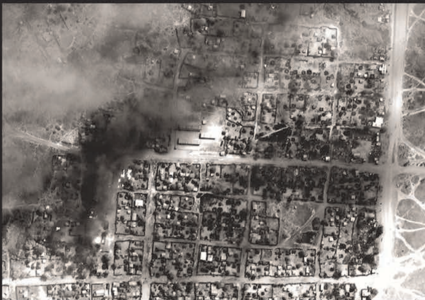
Bentiu town, South Sudan, on January 11, 2014.

Dozens of residential buildings on fire and massive smoke plumes visible in the town of Bentiu on the morning of January 11, a day after Government forces recaptured the town.