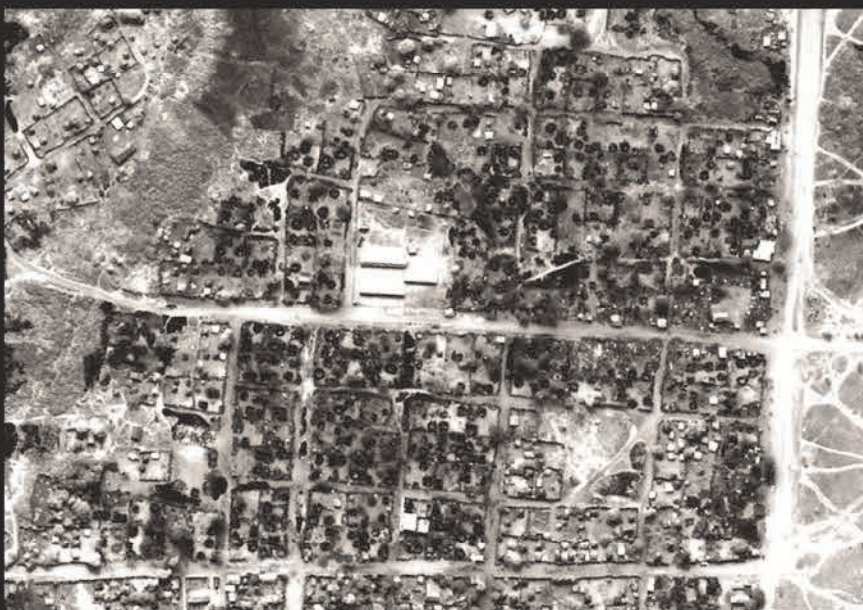
Bentiu town, South Sudan, on January 13, 2014.

Dozens of residential buildings on fire and massive smoke plumes visible in the town of Bentiu on the morning of January 11, a day after Government forces recaptured the town.