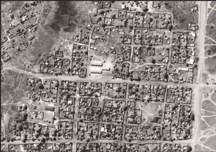
Bentiu town, South Sudan, on January 8, 2014.