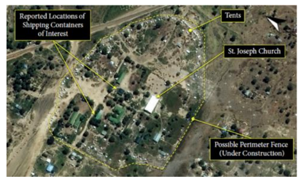
Satellite image of the Comboni Catholic Church compound where detainees were held by government forces.

Witnesses most consistently told Amnesty International researchers that they saw the detainees who subsequently died being held in the red container on the side of the compound used by the Comboni Sisters. The then-commissioner of Leer County, who was not present in Leer during the incident, told Amnesty International researchers that he subsequently requested an internal report about the killings. He told Amnesty International researchers that he was told the detainees who died were held in the red container on the Comboni Sisters side of the compound. Some witnesses however, said that the detainees who died were in a blue container or in a red container on the Brothers' side of the compound. All of the containers that witnesses described did not have any visible air holes or ventilation systems. Amnesty International was not able to determine whether the detainees who died were held in different containers on the church compound, but it is clear that at least some of these detainees died in the red container on the Sisters side of the church compound.