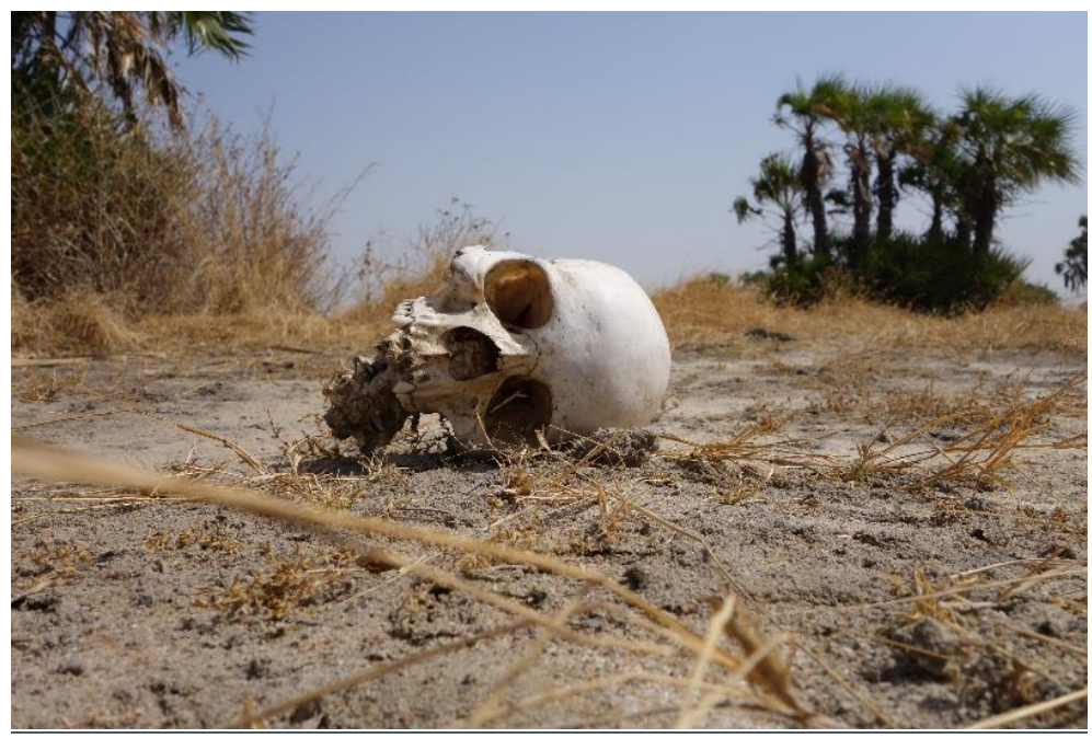
Human remains at the Kulier site found by Amnesty International.

Amnesty International researchers visited Kulier in Joung payam where witnesses said the bodies of the deceased were dumped by government forces in two pits. Amnesty International researchers observed human remains at the site. Remains were strewn outside of the pits identified by witnesses, very likely having been dragged there by scavenging animals.