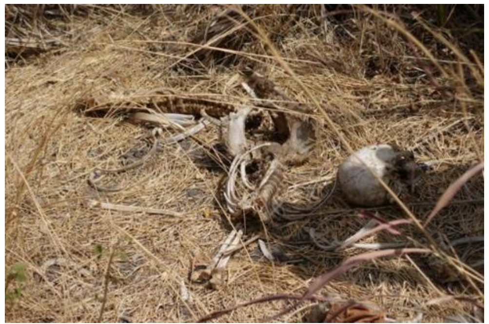
Human remains at the Kulier site found by Amnesty International.

Amnesty International commissioned a forensic analysis of the images of the remains taken by Amnesty International researchers in Leer on 11 February 2016. The forensic analysis was consistent with witness statements regarding the time of death and decay and the evidence of scavenging.